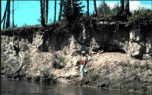
Floodplain sand and silt, Nechako River. GSC 1999-020