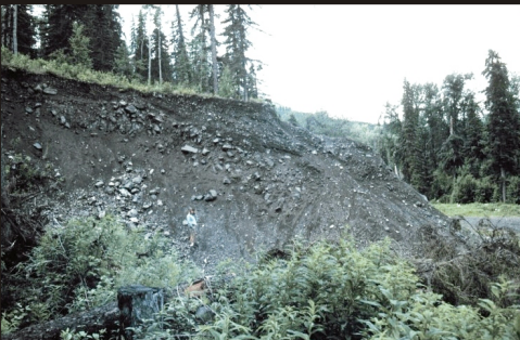
Slope sediments exposed in scarp. GSC 1999-023A