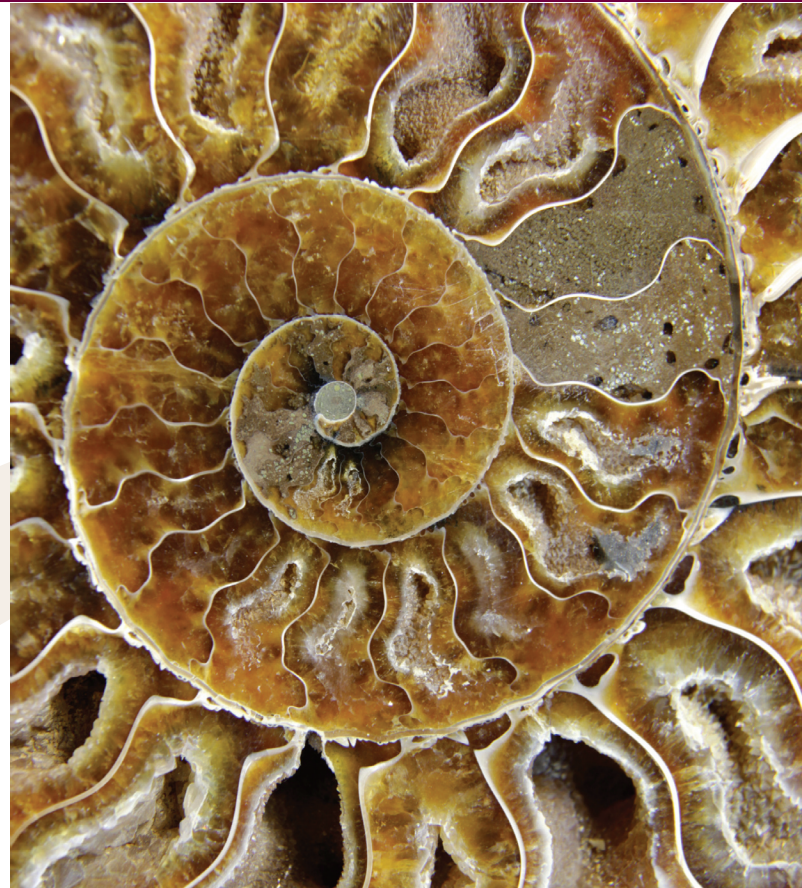
A fossil of an ammonite, an extinct ocean-living mollusk related to the modern nautilus. Ammonites evolved about 400 million years ago and were plentiful in the ocean until the occurrence of a global mass extinction > 65 million years ago that correlates with an asteroid impact.

6.7 The particular life forms that exist today, including humans, are a unique result of the history of Earth's systems. Had this history been even slightly different, modern life forms might be entirely different and humans might never have evolved.