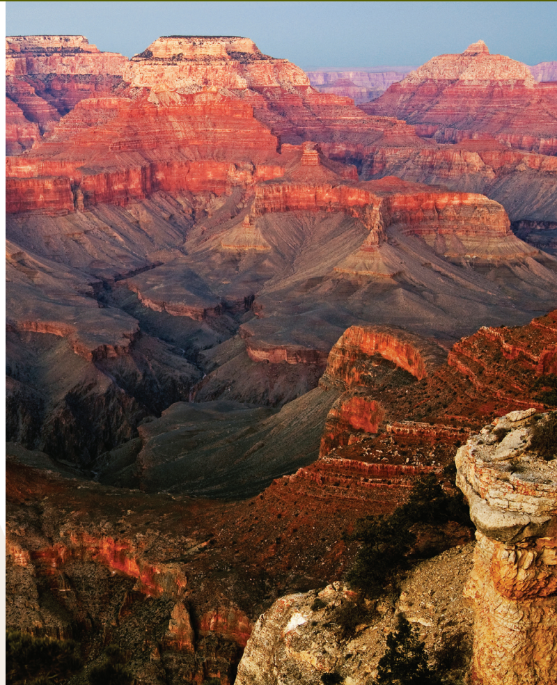
The Grand Canyon represents one of the most awe-inspiring landscapes in the United States. At the deepest parts of the canyon, nearly two-billion-year-old metamorphic rock is exposed. The Colorado River has cut through layers of colorful sedimentary rock as the Colorado Plateau has uplifted.

2.5 Studying other objects in the solar system helps us learn Earth's history. Active geologic processes such as plate tectonics and erosion have destroyed or altered most of Earth's early rock record. Many aspects of Earth's early history are revealed by objects in the solar system that have not changed as much as Earth has.