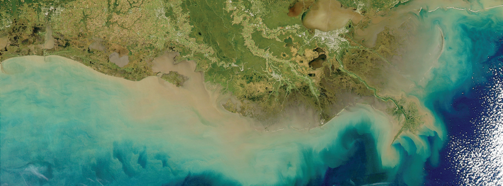
Louisiana coast with suspended sediments and organic matter flowing out of the Mississippi and other regional river systems into the Gulf of Mexico (MODIS Aqua satellite image, November 19, 2003,)