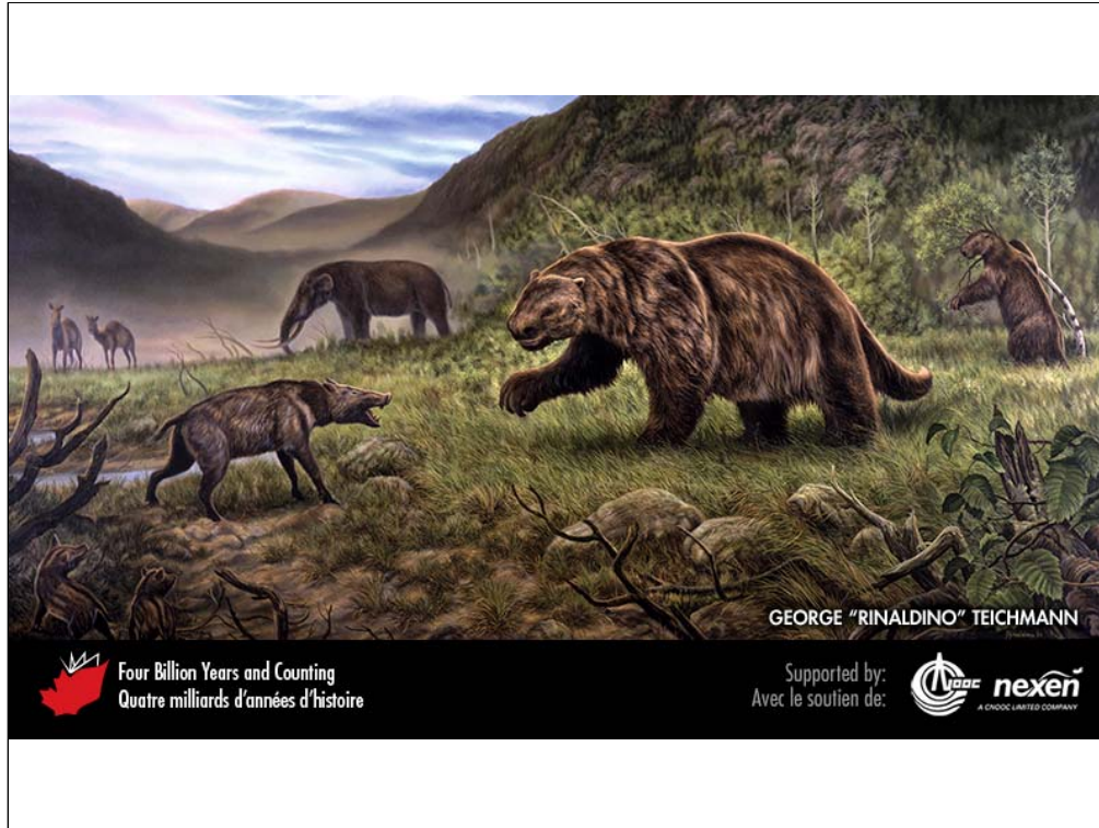
Scene from Beringia during the last interglaciation (Chapter 11) depicting a faceoff between a peccary (a laurasiatherian, with Eurasian ancestry) and giant ground sloth (a xenarthran, with South American ancestry). In the background is a mammoth (an afrotherian, with African antecedents) and two camels (laurasiatherians). BERINGIA INTERGLACIAL PERIOD , COPYRIGHT GOVERNMENT OF YUKON / ARTIST GEORGE "RINALDINO" TEICHMANN 2001.

All photographic and graphic images (henceforth referred to as images) posted on this site are copyright of the persons and/or institutions indicated in the caption directly associated with each image. The copyright holders have agreed that you may use their images for educational, non-commercial purposes only and provided that they are credited in each instance of use. For all other uses you must contact the copyright holder.