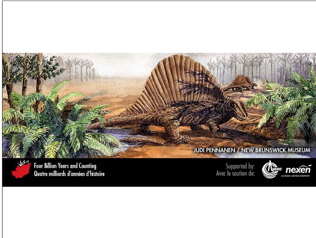
A Permian scene from Prince Edward Island, showing a group of Bathynathus (possibly equivalent to the more famous Dimetrodon , or at least a close cousin) prowling among cycads, with copses of small horsetail trees in the background. PAINTING BY JUDI PENNANEN, COURTESY OF THE NEW BRUNSWICK MUSEUM.

All photographic and graphic images (henceforth referred to as images) posted on this site are copyright of the persons and/or institutions indicated in the caption directly associated with each image. The copyright holders have agreed that you may use their images for educational, non-commercial purposes only and provided that they are credited in each instance of use. For all other uses you must contact the copyright holder.